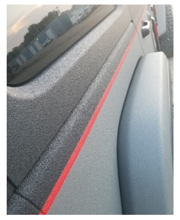
Tintable RAPTOR with various textures to create upgrade package at dealership.