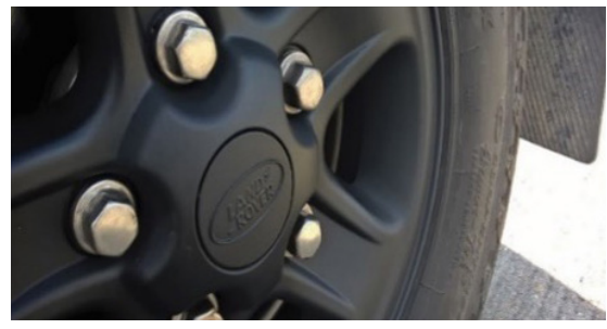
RAPTOR Black to create custom wheels.