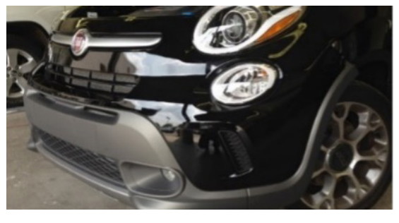
Tintable RAPTOR applied as a protective chip guard coating over waterborne basecoat.